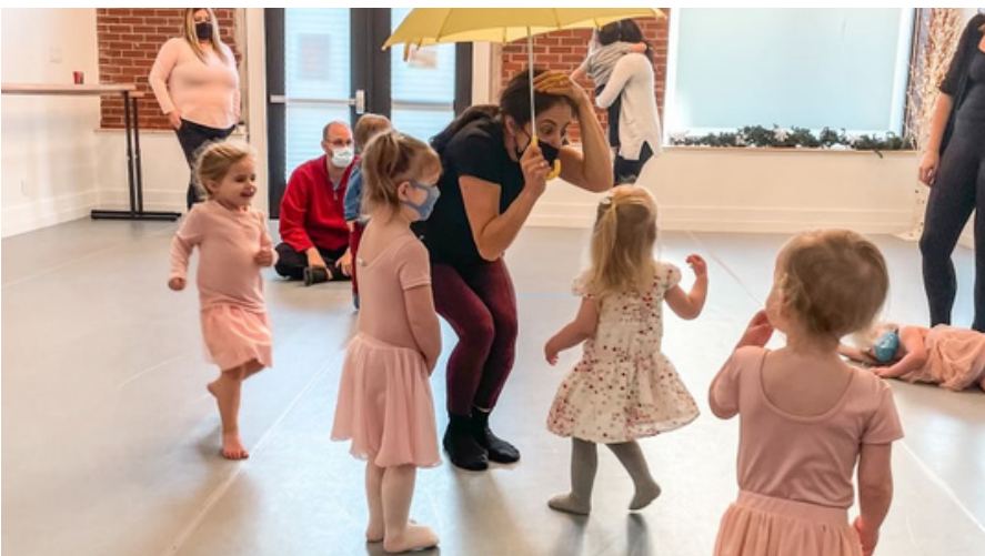
Saturday's Toddler Moves and Grooves (City)